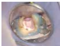
To ensure a waterproof joint between the tooth and the rubber dam