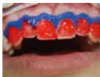
Gum protection during bleaching sessions at the chair